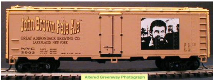
Altered Greenway Photograph