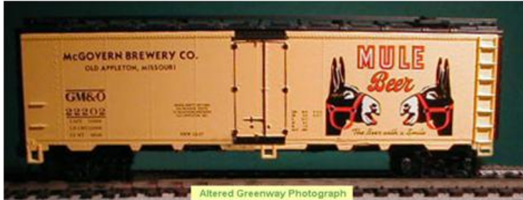
Altered Greenway Photograph