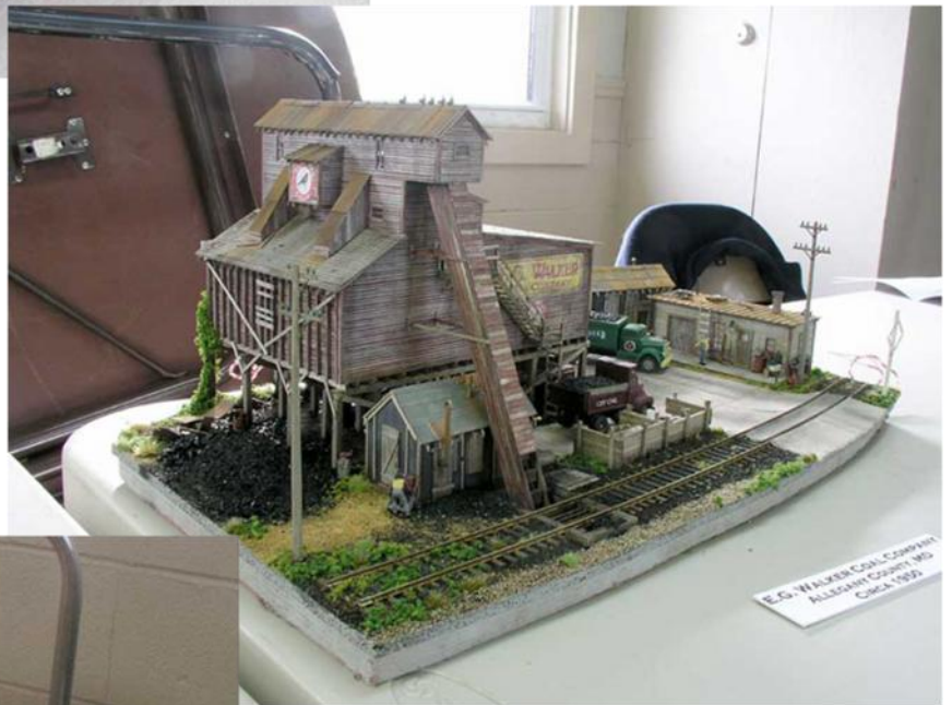
E.G. Walker Coal Company