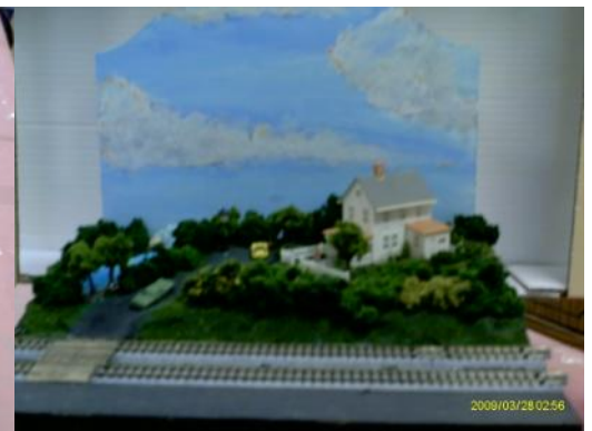
Elinda—"Elinda's Windy Day"