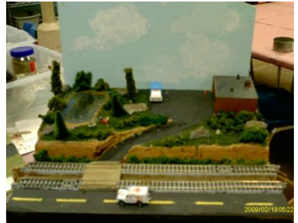
Right: "Summer Fun"