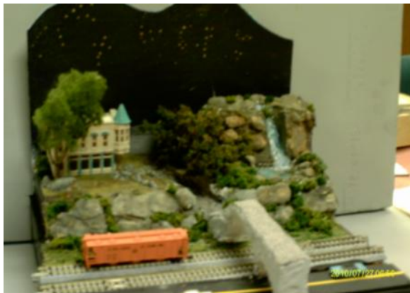
"Endless Summer" by Summer