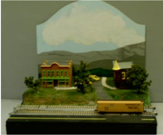
"William's Eats" by Derrick

Here are some more pictures from our young modelers at Eliada's Trains program. When they graduate from Eliada they earn "Hobo" status.