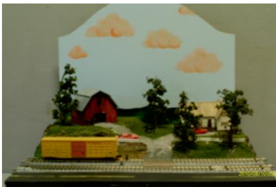
"Black Horse Ranch" by Courtland