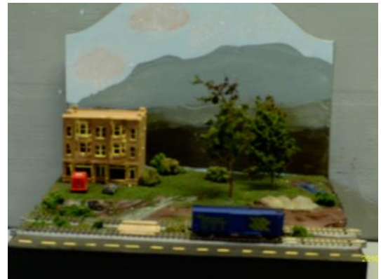
"Walter Creek Police Station" by Hayden