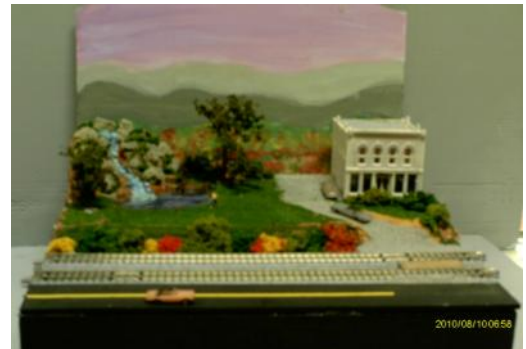
"Jupiter Rising" by Codie