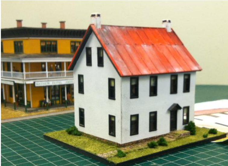
Jack's Conoco Gas Station above, and houses and hotel.