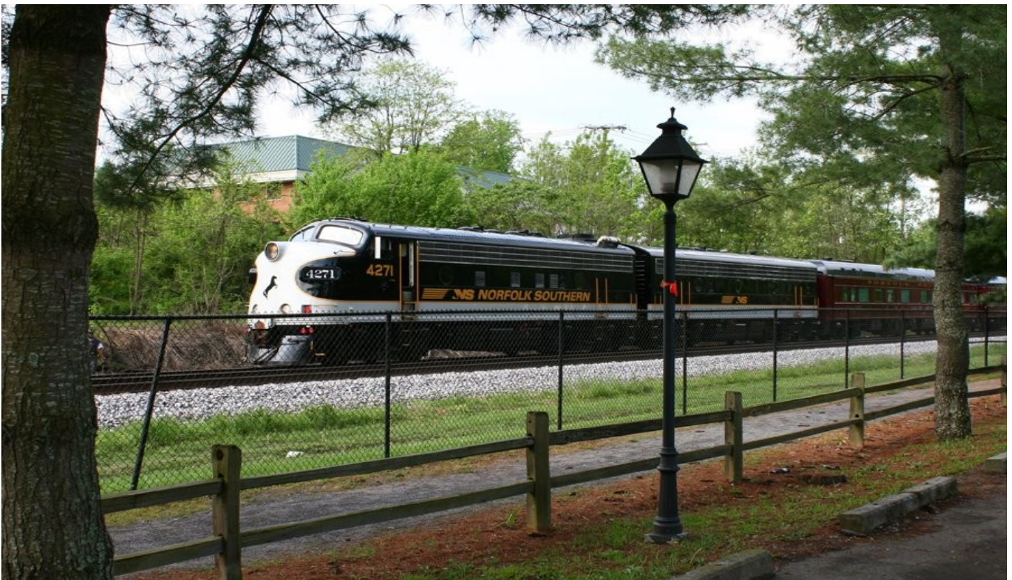
Two Norfolk Southern F units with a business train at Abingdon, VA earlier in June 2009.

Please keep us informed of changes in your address, phone number or email address.