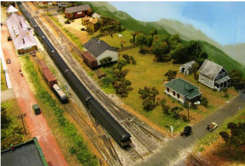
Above: The north-bound passenger train has just arrived at Hendersonville

The display includes a significant collection of Southern Railway artifacts, some on loan from the North Carolina Transportation Museum in Spencer.