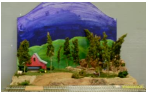
Sunset Valley by Zach