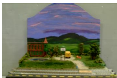
Sugar Loaf Elementary by Alden