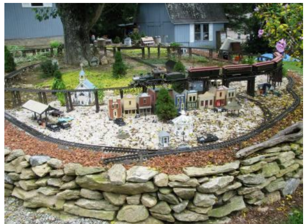
Part of Cy Miller's garden layout