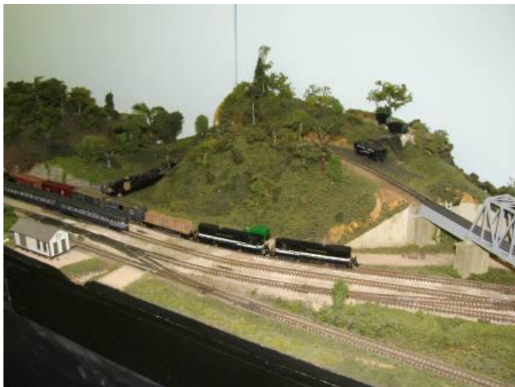
Left: Scenes from the French Broad e'N'pire NTRAK Club