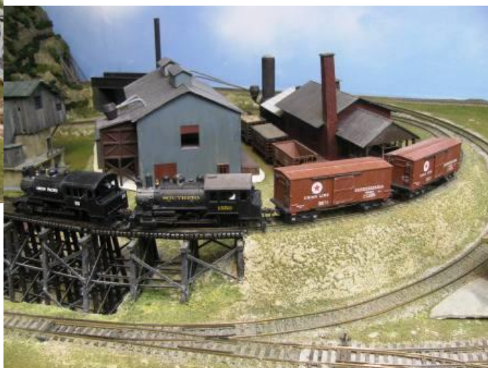
Below: The original part of Ken Granzin's layout