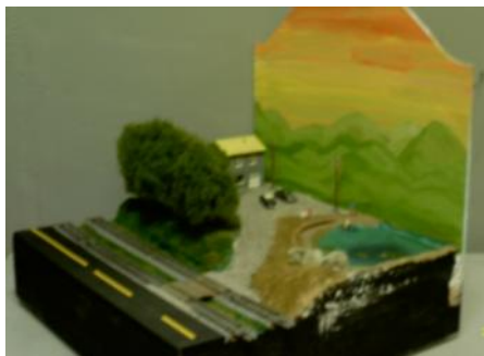
Happy Days by Bishop S