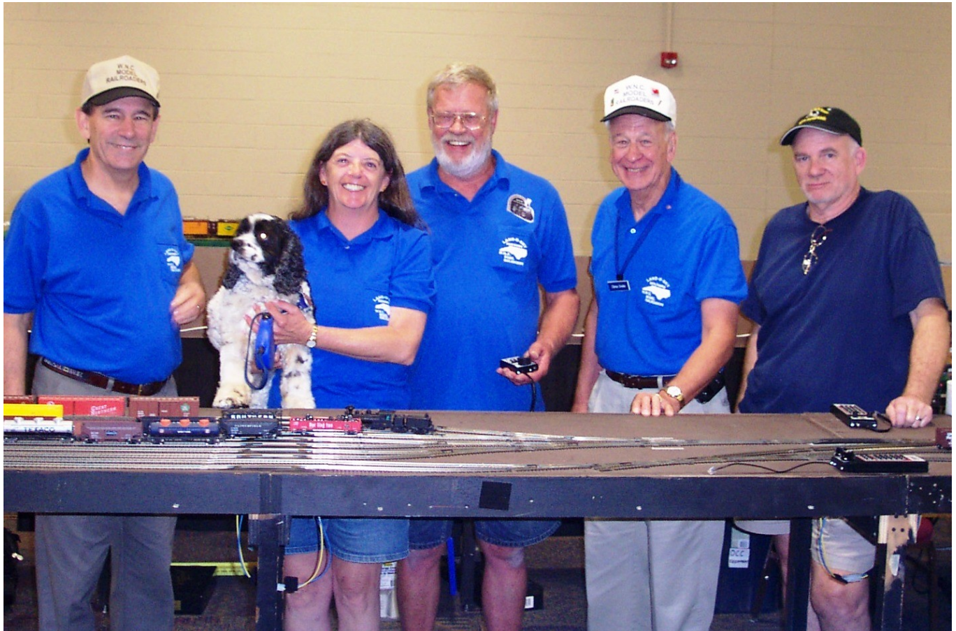
Having fun at the Train Show in Hickory.

Send comments about and contributions to this newsletter to chsmoke@bellsouth.net . Please keep us informed of changes in your address, phone number or email address.