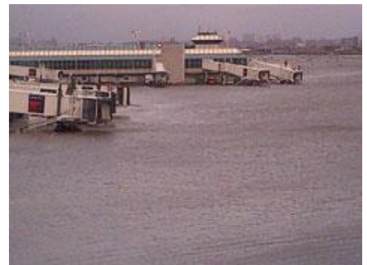
La Guardia Airport on 10/30/12

This report was written using information from Reuters and Railway Age websites.